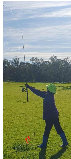
Helen's single handed casting technique in action