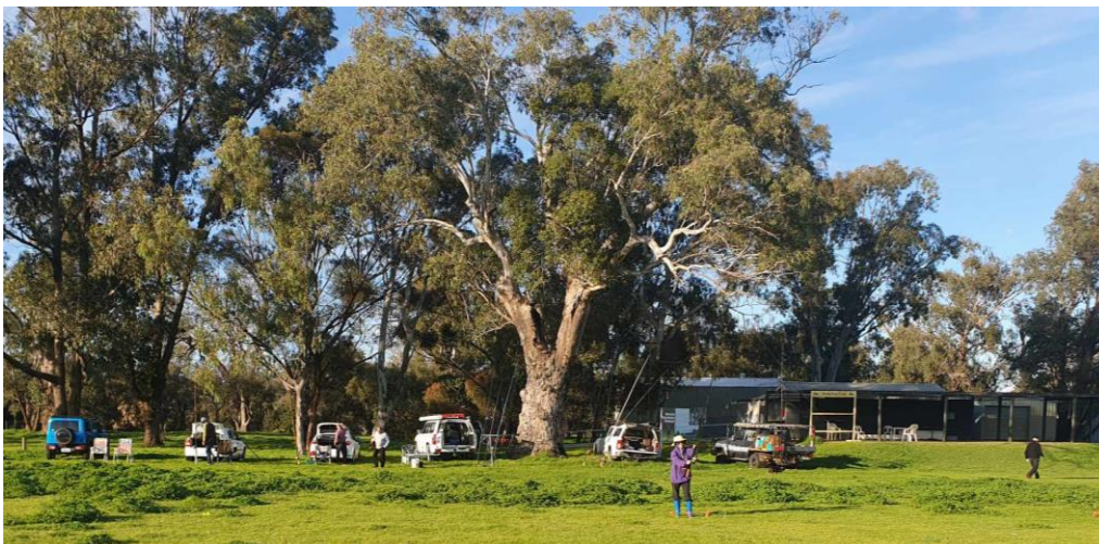
The group's setup for the morning