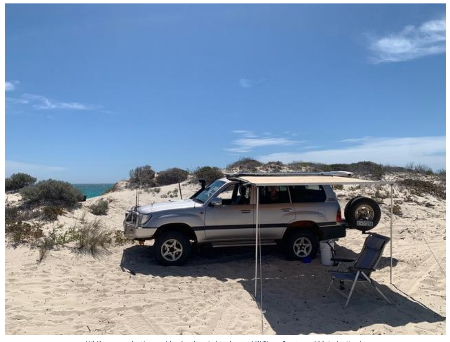
Whiling away the time waiting for the wind to drop at Hill River.