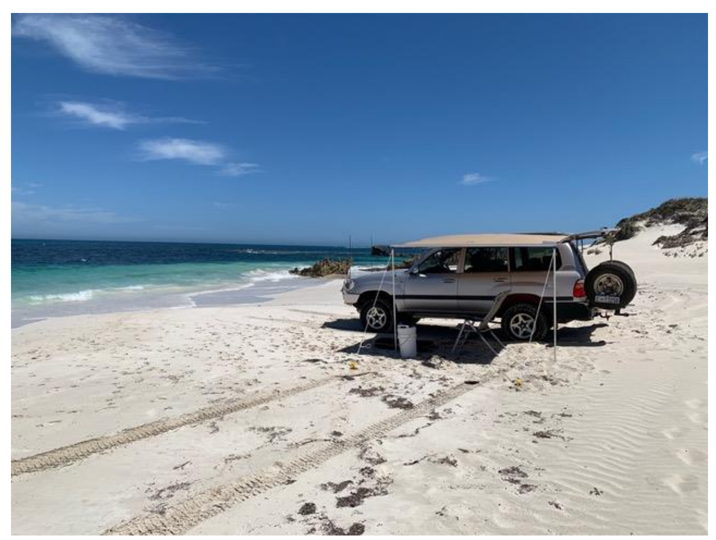
Soaking up the serenity at Sandy Cape beach.