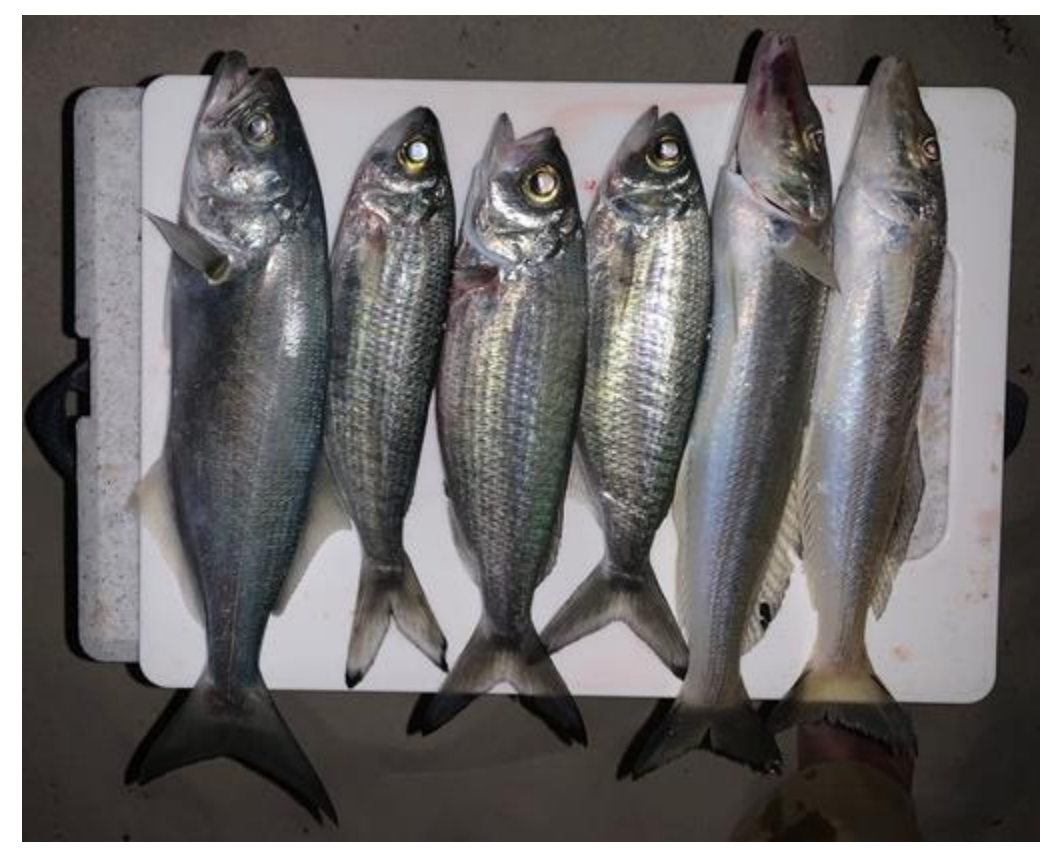
Catch of the day.