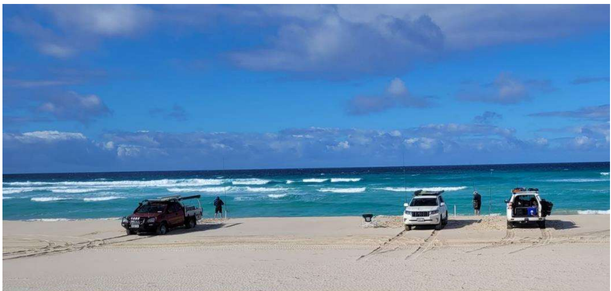
Swell coming up over the reef