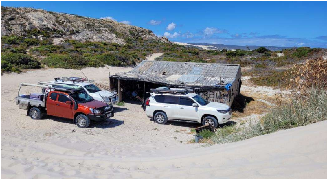
Back at the shack