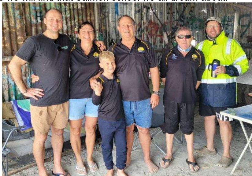
Hanging out in the shack

So Reef Beach this time had a lot of water between bites; not very many Salmon but the scenery and location is fantastic and on it's day Reef Beach can turn the fishing on, so maybe next time we will find that Salmon school we all dream about.