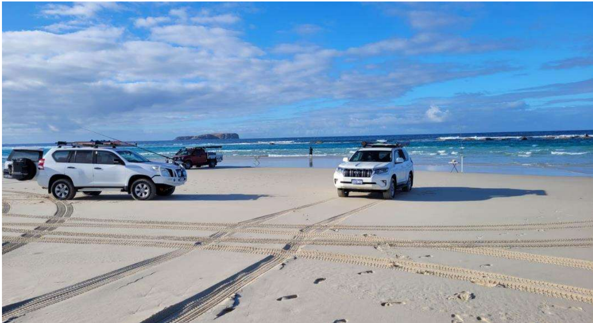
Setting up at the lagoon

Mark reported plenty of Herring and other reef species so we decided to fish the lagoon with our light fishing rods for a while. Just after I put a rig on my light rod I noticed a black patch in the lagoon, which I thought it may be some Salmon so I put some bait on the size 1 circle hook and cast into the patch. Almost immediately I was on and the salmon took off, peeling line off the small reel; I increased the drag but it was still going until the hook pulled and the fish was gone.