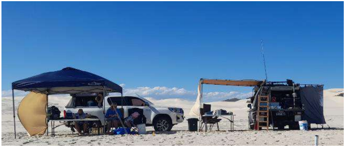
Wessels' beach camp