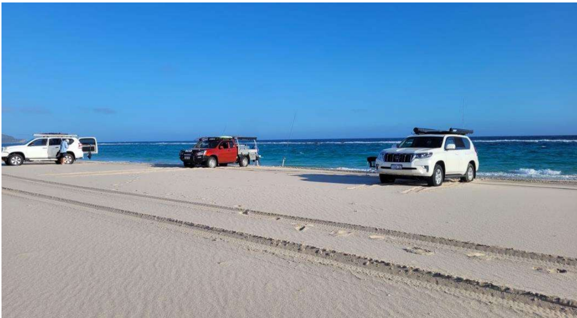
Getting ready to start fishing

After unpacking the cars and having some lunch we went for a drive along the beach; the water looked good with some nice gutters. We drove to the eastern end and found Mark had arrived earlier and was set up at the lagoon, we fished for a while at a spot about half way back to the shack but not too much was being landed so we headed back at 6pm to sort out dinner.