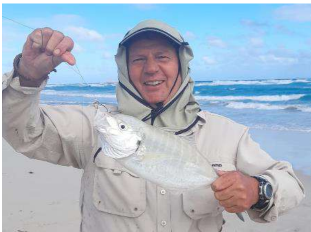
Peet with a Skippy