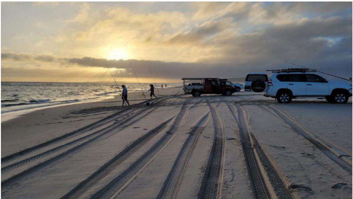
Sunset at Reef Beach