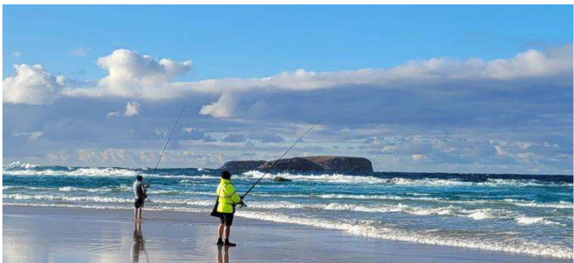
Fishing the reef