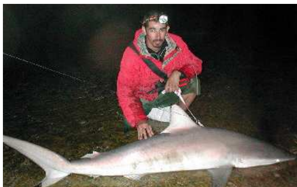
Damo and Black Tipped Reef Shark.