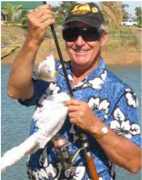
Hendo with a "monster" black bream.